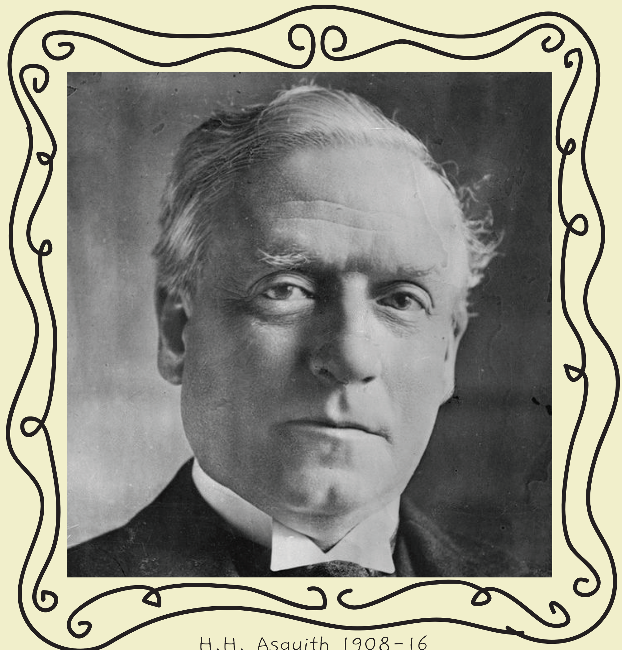
H.H. Asquith 1908-16