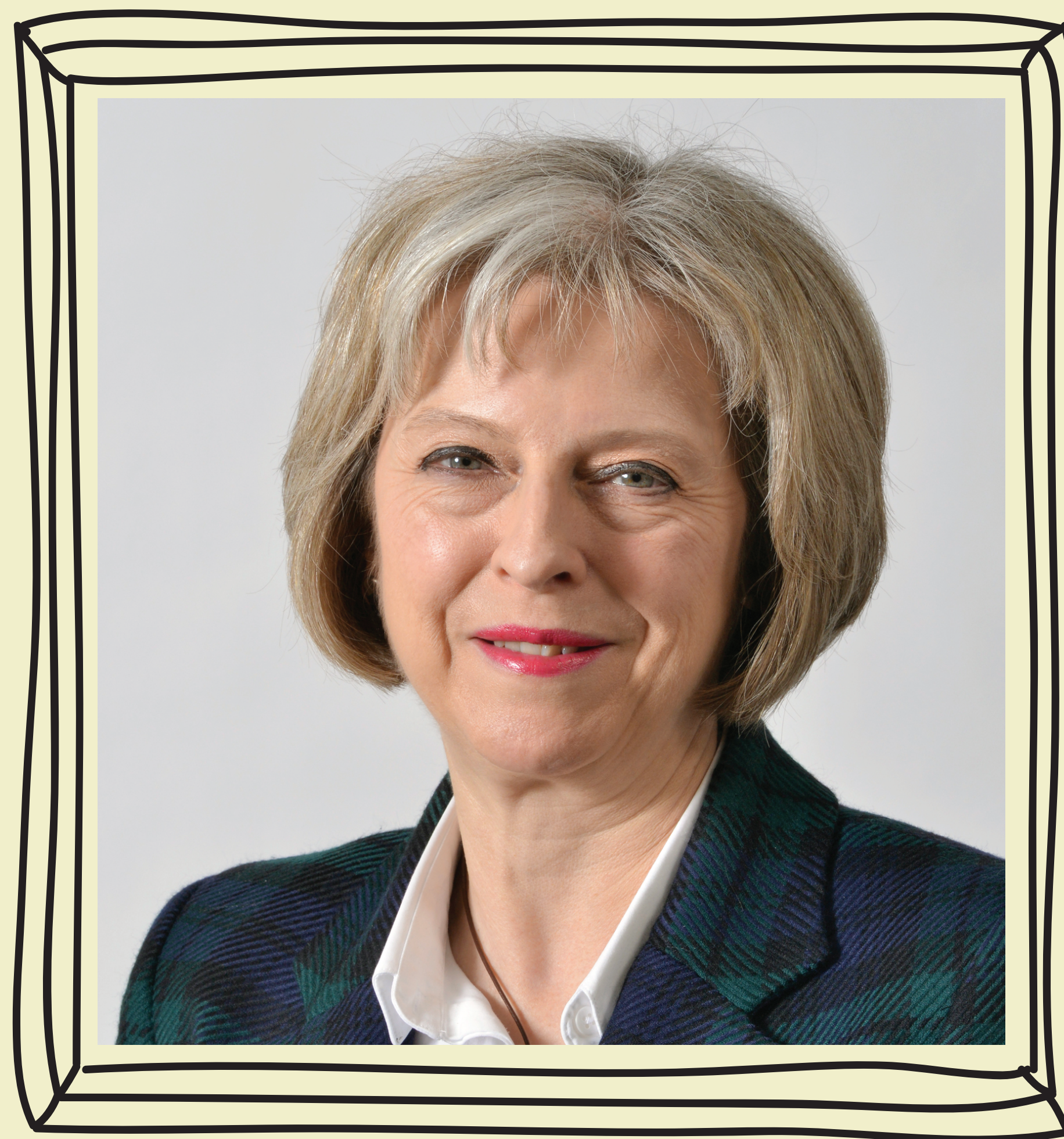
Theresa May 2016-19